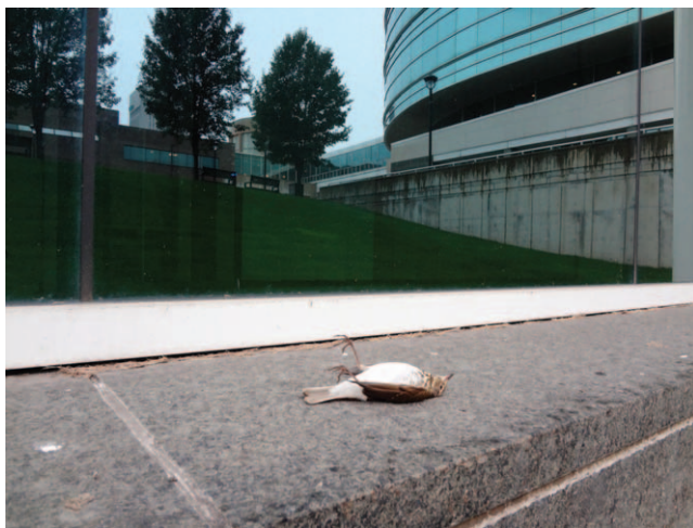
FIGURE 1. A Swainson's Thrush killed by colliding with the window of a low-rise office building on the Cleveland State University campus in downtown Cleveland, Ohio.

Research on bird–building collisions typically occurs at individual sites with little synthesis of data across studies. Conclusions about correlates of mortality and the total magnitude of mortality caused by collisions are therefore spatially limited. Within studies, mortality rates have been found to increase with the percentage and surface area of buildings covered by glass (Collins and Horn 2008, Hager et al. 2008, 2013, Klem et al. 2009, Borden et al. 2010), the presence and height of vegetation (Klem et al. 2009, Borden et al. 2010), and the amount of light emitted from