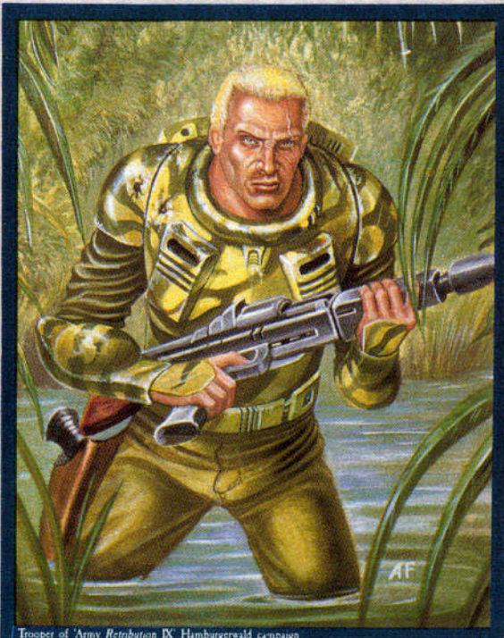
Trooper of 'Army Retribution IX' Hamburgerswald campaign