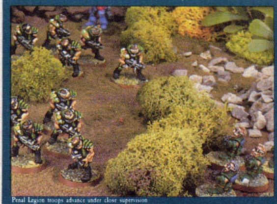
Penal Legion troops advance under close supervision

Barbican - before visitors may enter the fortress-monastery they must pass through the gate-house or barbican. This is always guarded so that visitors may be properly received. Not all visitors come overland, so the barbican has its own landing and launch pads to facilitate the reception of airborne craft.